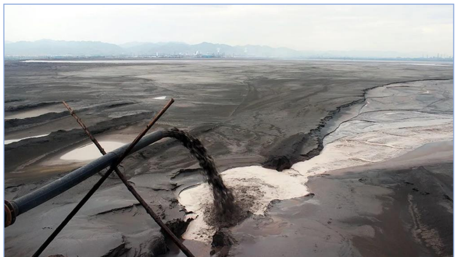
Toxic rare earth mineral sludge lake, Inner Mongolia. April 2015

Many other countries which currently produce and process critical components do not have the comprehensive environmental and labor standards employed in the United States. The lack of sufficient standards has significant environmental impacts, such as the production of toxic sludge which is often left untreated and held in unlined, open-air sludge lakes. Additionally, significant concerns related to the use of child and other forced labor in some countries has been raised.