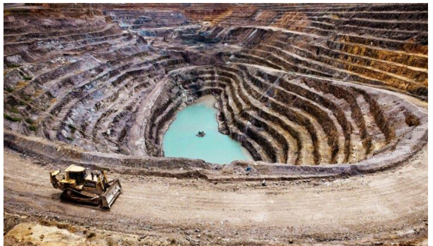
Cobalt Mine June 2020

Transitioning the U.S. vehicle fleet to all electric vehicles (EVs) requires significant amounts of materials for their production and operation from foreign sources. Just the batteries alone would require our reliance on foreign resources.