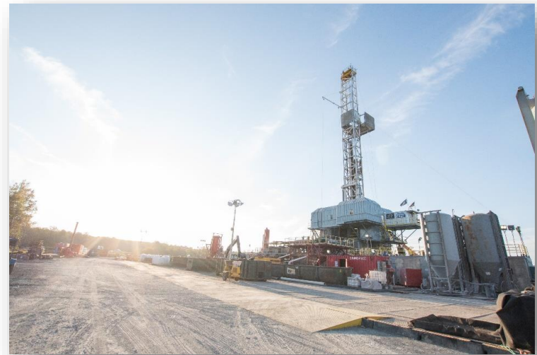
Drilling rig in Potter County, PA