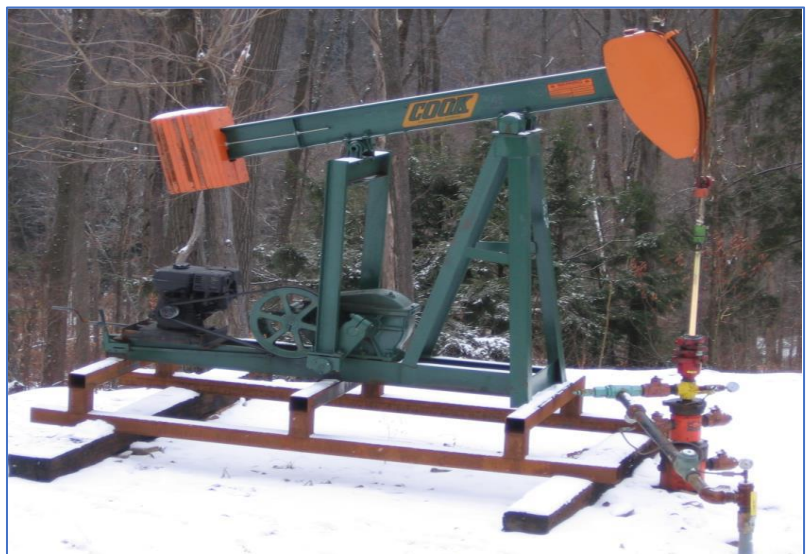
Modern conventional oil well.

Most recently, the 2021 Infrastructure Investment and Jobs Act allocates $4.7 billion for states to plug abandoned wells. Pennsylvania could receive up to $300 million over the life of this program.